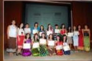
LAS Education Award Ceremony - Scholarships to Laotian College Students and Awards to Laotian Schoolkids