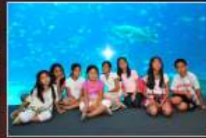
2 Senior Citizen Trips to Georgia Aquarium